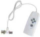
PFM820 UTC Controller